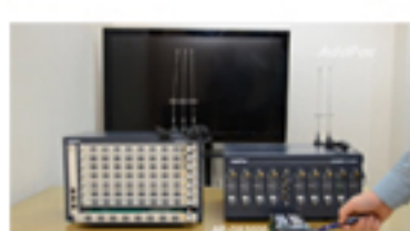
32-Port Multisim GSM Gateway Solution