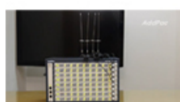
32-Port Multisim GSM Gateway AP-GS3200